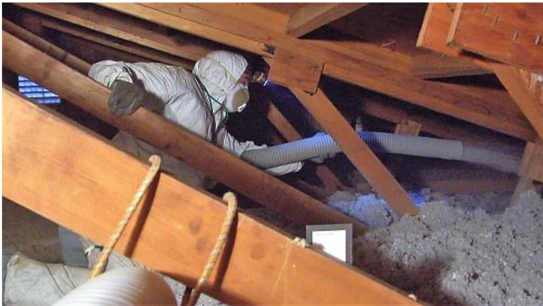
Adding attic insulation to reduce heat loss is one of the primary activities of the Weatherization program.

These programs are all offered statewide and are funded by the Wisconsin Department of Administration's, Division of Energy, Housing, and Community Resources (DEHCR). Project Home is the agency that operates the Weatherization and Furnace Programs in Dane and Green Counties.