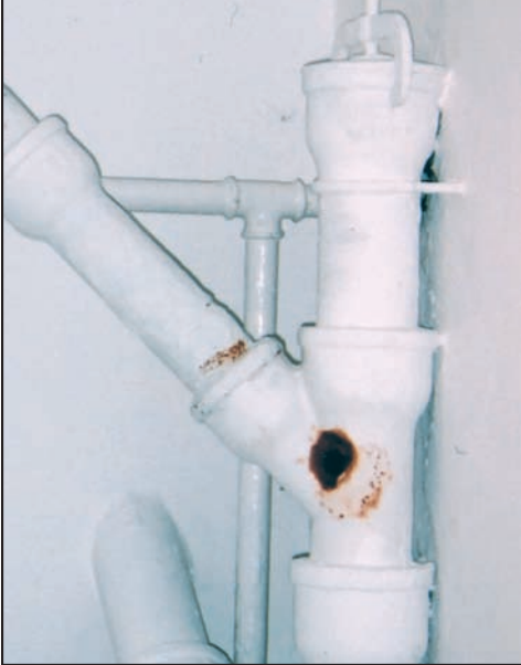
Rust is an indicator that condensation occurs on this drainpipe. The pipe should be insulated to prevent condensation.

Renters: Report all plumbing leaks and moisture problems immediately to your building owner, manager, or superintendent. In cases where persistent water problems are not addressed, you may want to contact local, state, or federal health or housing authorities.